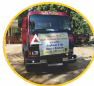
Awareness generation programme and Mock drill of Fire Safety in Special Children School