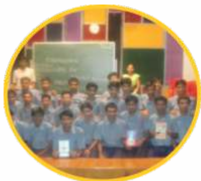
Road show of Emergency Vehicles

The purpose of the programme was to sensitize and make people aware about disaster and disaster management. Following activities are conducted at district level to celebrate IDDR: